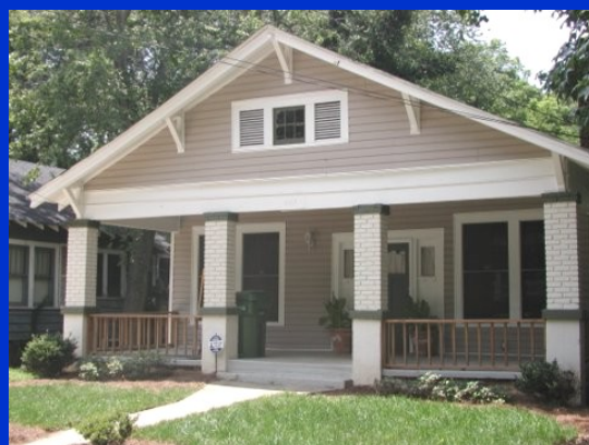
UCDC-Renovated House at 503 Atwood

Morehouse College received $400,000 grant from HUD to create a Neighborhood Revitalization Task Force, which consists of students, faculty, and staff from the college and includes representatives from the seven neighborhood organizations located in the area. Through these organizations, students will be provided community service internships. Morehouse will work on behalf of the community, with the City of Atlanta, to develop specialized neighborhood revitalization plans. Such plans will be the basis for creating a HUD approved neighborhood revitalization strategy area.