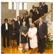
West End, Atlanta University Center Donor Reception

The proposed WE-CID, representing the Historic West End, would be a self-taxing district that will use additional property taxes from commercial and industrial property owners to augment local, state, and federal dollars for projects.